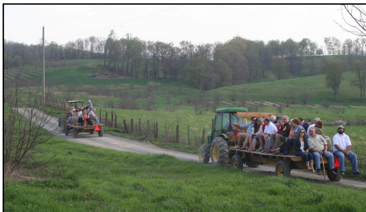
Tour of the American Chestnut Meadowview Farm breeding orchard from previous event.