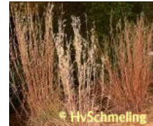
Little Bluestem Grass Schizachyrium scoparium