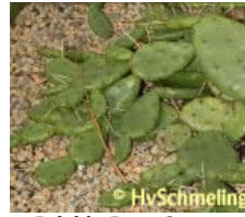
Prickly Pear Cactus Opuntia humifusa