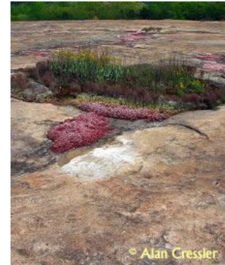
'Dishgarden' on Mt. Arabia

The Chattahoochee Nature Center's roof top garden is a unique display of plants native to granite rock outcrops in the Piedmont region of Georgia. With over 90% of granite outcrops in the southeast located in the state of Georgia, this landscape is a signature part of the local landscape. Most people are familiar with Stone Mountain, but they are not aware of the unique assemblages of plants that have adapted to the extreme environments of granite outcrops. Many of the species found on these granite outcrops are found nowhere else in the world. Several endangered plants grow on these outcrops. The thin soils, limited water, and extreme temperatures of granite outcrops are remarkably similar to the conditions on green roofs. The plants found on granite outcrops are well suited to thrive on a green roof like the Chattahoochee Nature Center's Discovery Center.