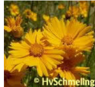
Large Flowered Tickseed Coreopsis grandiflora