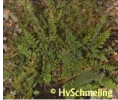
Hairy Lip Fern Cheilanthes lanosa