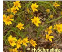
Stone Mountain Daisy Helianthus porteri