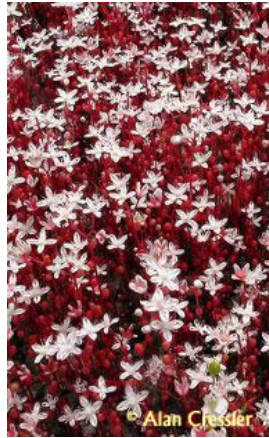
Small's Stonecrop Diamorpha smallii

A green roof featuring these granite outcrop plants celebrates the local landscape by showcasing plants unique to the Piedmont region. Some of the plants featured include: Little Blue Stem ( Schizachyrium scoparium ), Confederate Daisy ( Helianthus porteri ) Cottony Groundsel ( Senecio tomentosus ), Prickly Pear Cactus ( Opuntia compressa ), Appalachian Fumeflower ( Talinum teretifolium ) and Small's Stonecrop ( Diamorpha smallii ). These plants are massed together to form a colorful tapestry with interest in all seasons. Over 80% of the green roof features a granite outcrop plant palette, and the rest of the roof consists of sedums and other more conventional plants for green roofs. These plants are included in order to extend the seasonal interest of the green roof and to serve as a counterpoint to the granite rock outcrop plants. Visitors are able to compare and contrast the granite outcrop plants with the conventional green roof plants. The green roof has a valuable environmental educational role in two key areas: 1) exposing the public and visitors to a plant palette not currently used in the green roof industry and 2) educating visitors about the underappreciated landscape of granite rock outcrops.