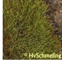
Pine Weed Hypericum gentinioides