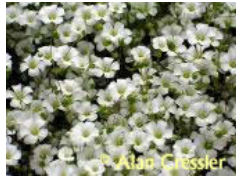
Sandwort (February-May) Minuartia uniflora