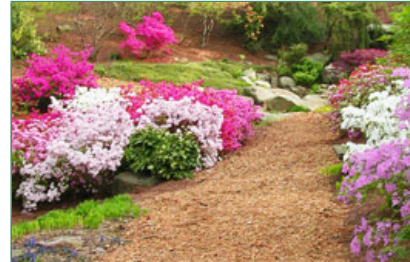
Wander among the Azaleas and rhododendrons featured in this contemporary garden.