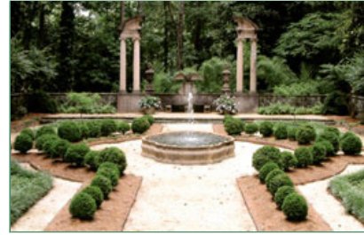
Enjoy the lavish landscape of Swan House featuring a boxwood garden and a cascading fountain.