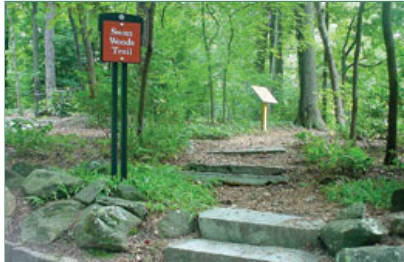
Explore the Georgia Piedmont's woodlands ecosystem.