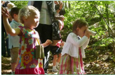
Seven interactive discovery stations encourage children to play, explore, imagine, ask questions, and seek additional knowledge on the environment around them.