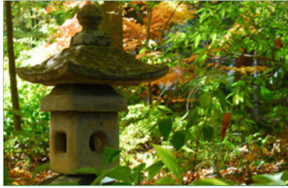
Observe how Asian plants and rhododendrons mingle in this exotic environment.